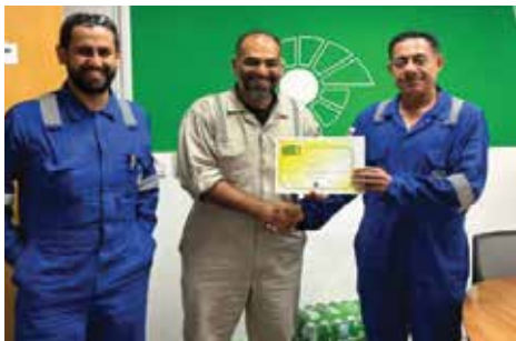
PDO RECOGNISES SAS FOR EXCELLENCE IN ENHANCING HSE