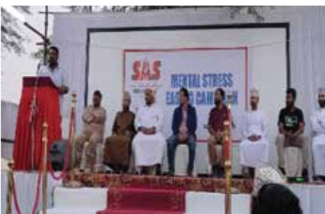
MENTAL STRESS RELIEF CAMPAIGN AT SAFAH ON 29 OCT 2023