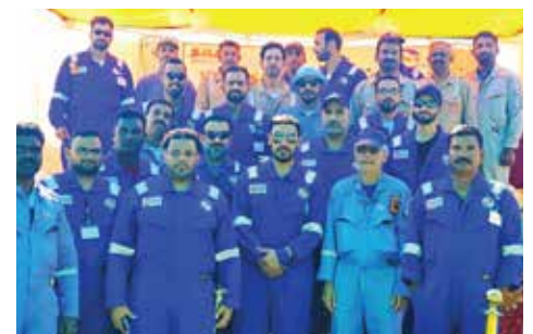
Company celebration at Safah and WADILATHAM sites