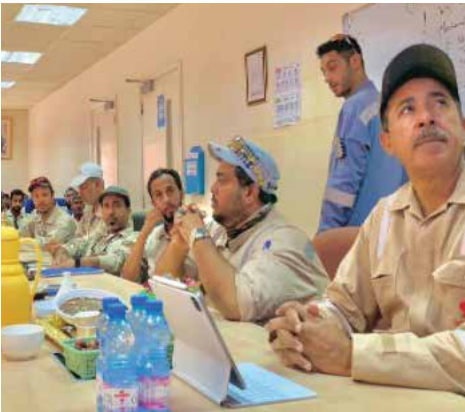
MANAGEMENT VISIBILITY Q&A - FAHUD & YIBAL SITE