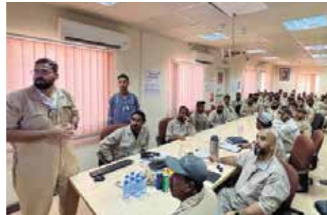
CEO/MANAGEMENT VISIBILITY FAHUD & YIBAL ON 1 NOV 2023