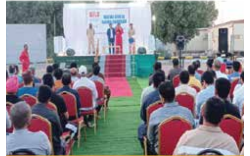
MENTAL STRESS RELIEF CAMPAIGN AT WADILATHAM ON 28 OCT 2023