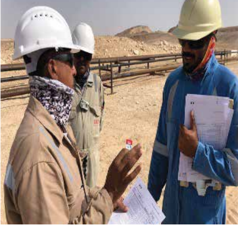
MANAGEMENT VISIT TO FAHUD