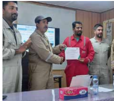
CEO/MANAGEMENT VISIBILITY Q&A SAFAH & WADILATHAM SITE