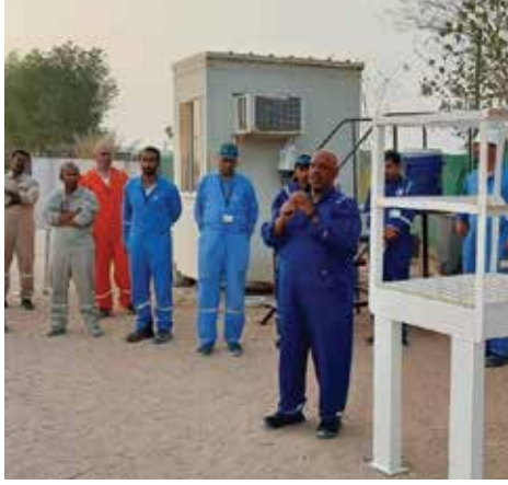
MANAGEMENT VISIT TO SAFAH