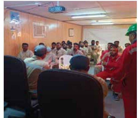
SAFAH TEAM MEETING