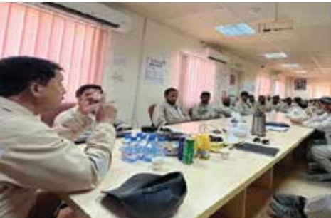
CEO/MANAGEMENT VISIBILITY FAHUD & YIBAL ON 1 NOV 2023