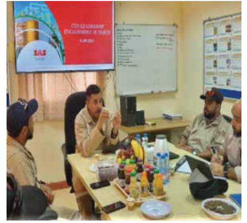
MANAGEMENT VISIT TO FAHUD & YIBAL